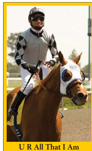
U R All That I Am