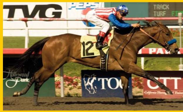
$73,200 Warren's Thoroughbreds Stakes