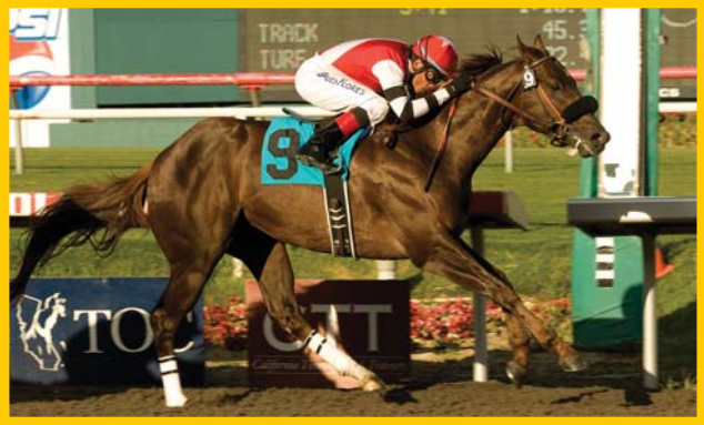
$62,000 NTRA Stakes