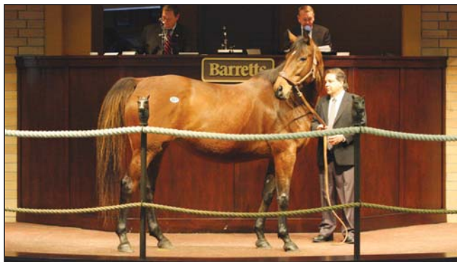
Hip Number 301: Gentlemen's Crown – $65,000