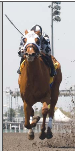
U R All That I Am $147,300 B. Thoughtful Stakes April 24, 2010