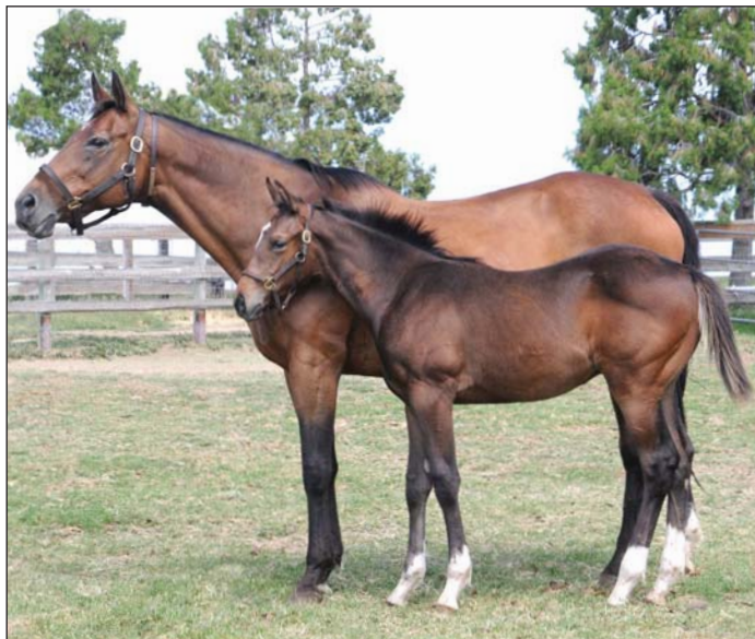
Fort Silver and her 2010 Terrell colt at Dignitary Downs in Anza, California, on August 3, 2010.