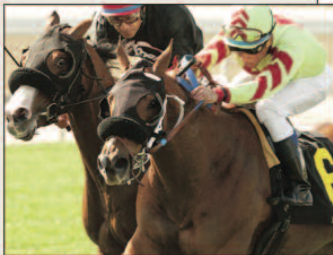
Red Outlaw, Gangnam Guy and Horse Laugh: Barretts October Trifecta in the 2014 Baffle Stakes