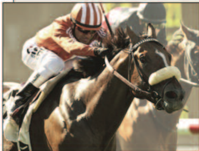
October Sale graduate and California Champion Three-Year-Old Male Gervinho (G2, $422,140)